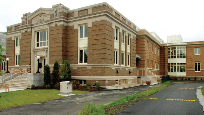
West Street view of the newly expanded & renovated library

"The library is a hopeful thing, built and sustained by people who love books, and love what happens in their company, who know the importance of what we say and how we say it, who recognize that democracy thrives in places like this."