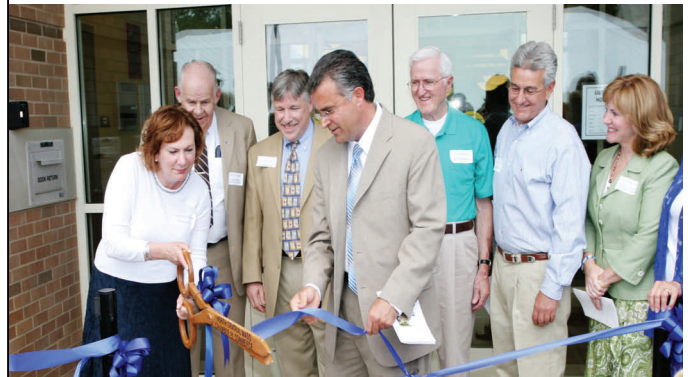
Ribbon cutting at the dedication of the Leominster Public Library