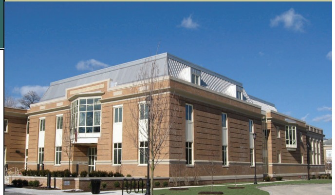
Renovated and Expanded Leominster Public Library Opened June 10, 2007