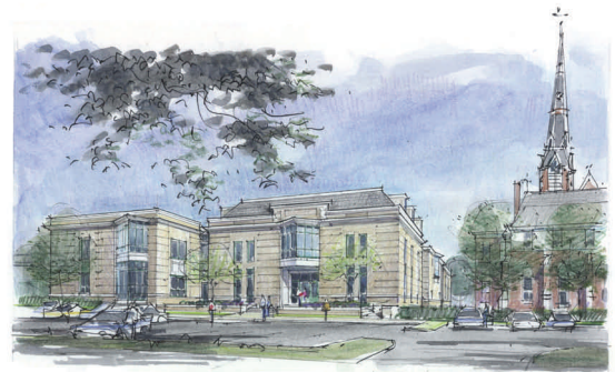
Artist rendering of proposed Pearl Street entrance

On September 8, 2003, the Leominster City Council voted unanimously to borrow $7.8M to construct, equip, and furnish the expansion and renovation of the public library. The newly expanded library is slated to open in 2006, just in time to celebrate 150 years of public library service to the community.