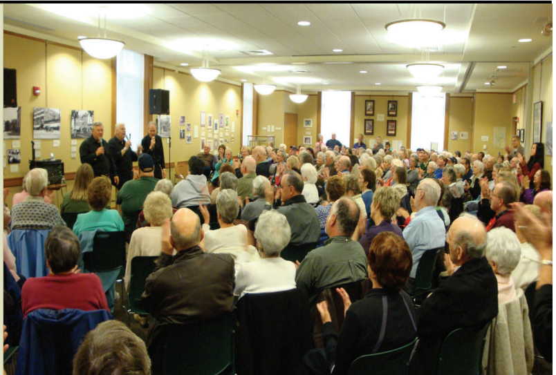
The Three Tenors performed as part of the library's popular Spend Sunday Afternoons at the Library series, drawing 180 people who delighted in the music of the '50s, '60s and '70s.

However, the best feature is the staff. They are always courteous, efficient and pleasant. I really cannot compliment them enough. . . . Congratulations on having "The Best Librarians in the World." I am fortunate to be a patron.