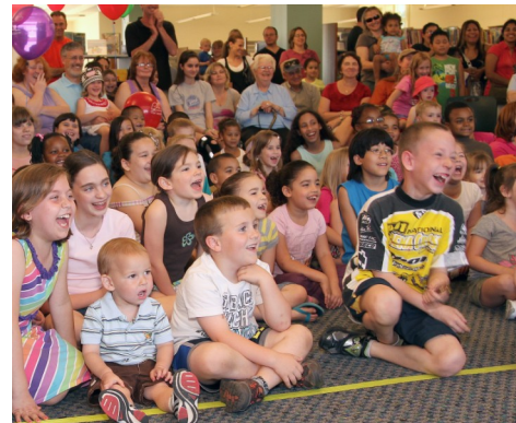
5th Annual Feldman Family Children's Festival